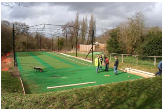
The net refurb continues

It may have poured down, but The Manors intrepid band of helpers were not to be deterred. Much good work was carried out by the members that gave up their time to help their club and improve facilities for all. Well done to all that turned up to help.