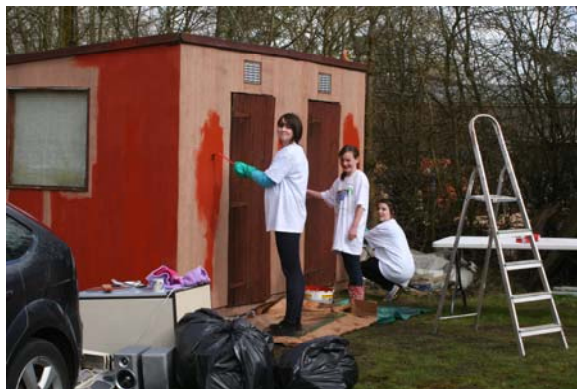
All ages and genders joined in