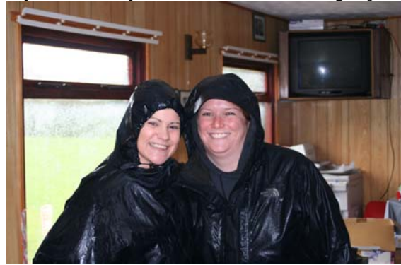
The Noble, Other 'alfs brave the weather

It may have poured down, but The Manors intrepid band of helpers were not to be deterred. Much good work was carried out by the members that gave up their time to help their club and improve facilities for all. Well done to all that turned up to help.